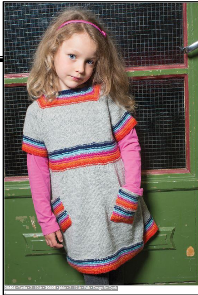
30404 • Tunic • 2: 10 g • 30404 • Jule • 2: 12 g • Falk • Design: Sir Dyak

Col 1, 2, 3, 4, 5: 50 g all sizes Col 6: (200) 200 (250) 300 (350) g