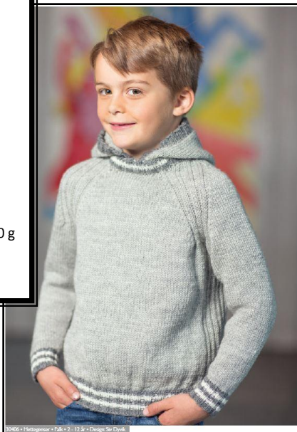
30406 • Hooded pullover • Falk • 2: 12 g • Design: Sir Dyak

Col 1: (250) 300 (350) 400 (450) 500 g Col 2: (50) 50 (50) 50 (100) 100 g Col 3: 50 g all sizes