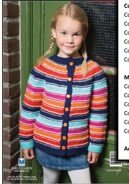
DALE GARN www.dalegarn.no Dale Garn AS 5720 Dalsheim Norge TE: +47 34 999 999 fax: +47 34 50 06 52