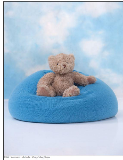
29808 • Sacco sold • Lille Lerke • Design: Chag Klippe