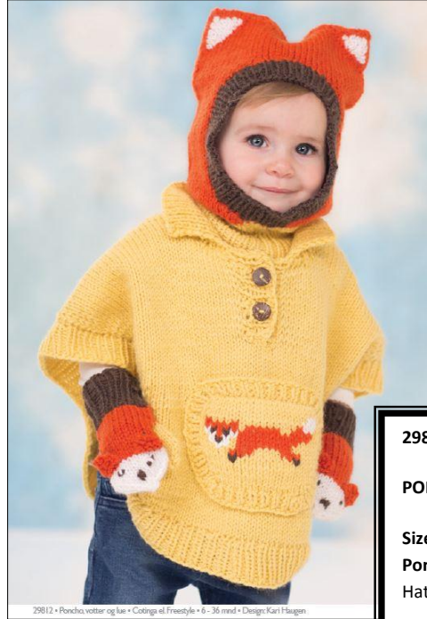
29812 • Poncho vatter og lue • Cotinga el Freestyle • 0 - 36 med • Design: Karri Fausgen